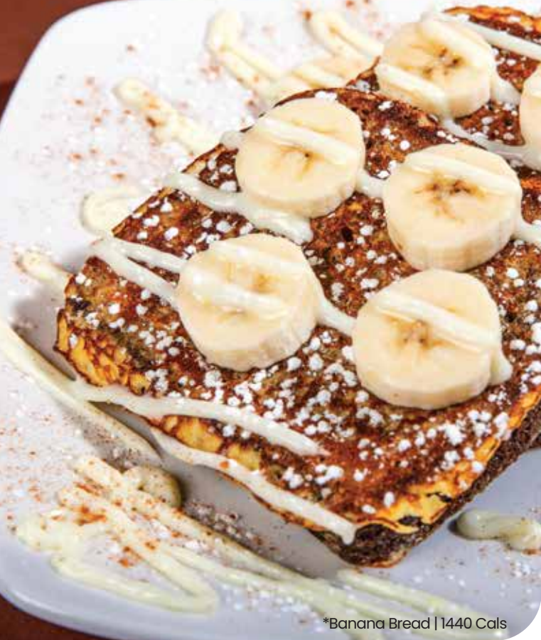
*Banana Bread | 1440 Cals