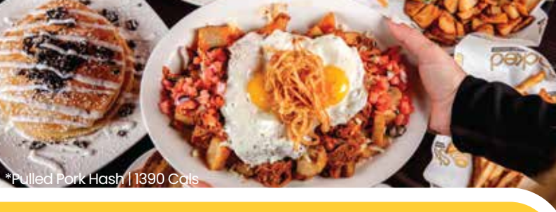
*Pulled Pork Hash | 1390 Cals