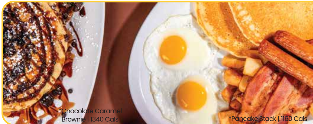
*Chocolate Caramel Brownie | 1340 Cals