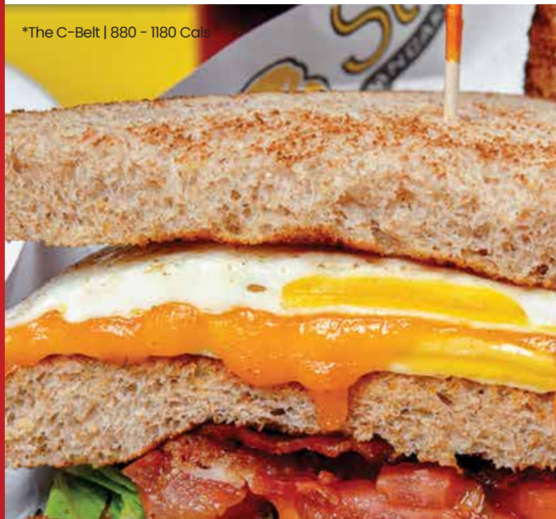
*The C-Belt | 880 – 1180 Cals