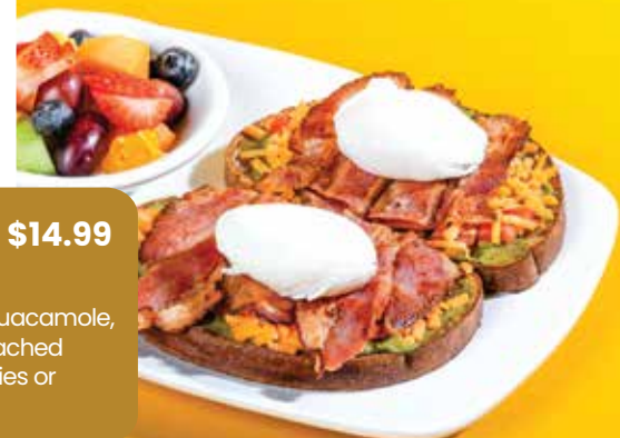
*G.B.C. Avocado Toast | 750 - 860 Cals

2 pieces of rye toast topped with guacamole, pico salsa, cheddar, bacon & 2 poached medium eggs. Served with homefries or fresh fruit.