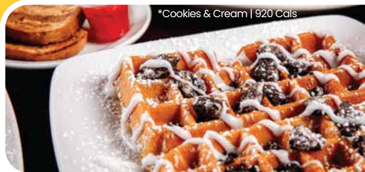
*Cookies & Cream | 920 Cals