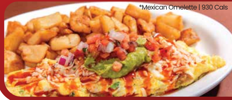
*Mexican Omelette | 930 Cals