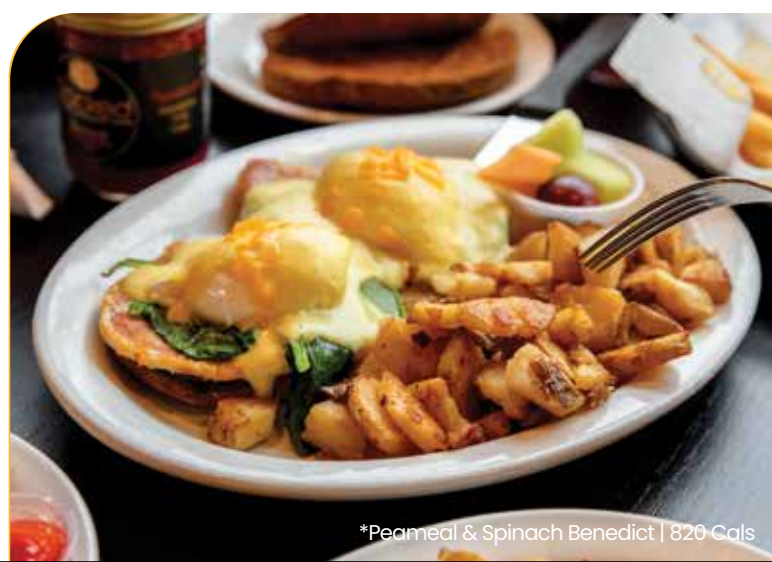
*Peameal & Spinach Benedict | 820 Cals

Adults and youth (ages 13 and older) need an average of 2,000 calories a day, and children (ages 4 to 12) need an average of 1,500 calories a day. However, individual needs vary.