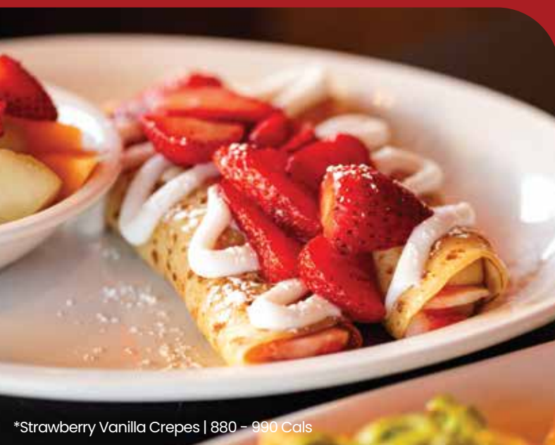
*Strawberry Vanilla Crepes | 880 - 990 Cals