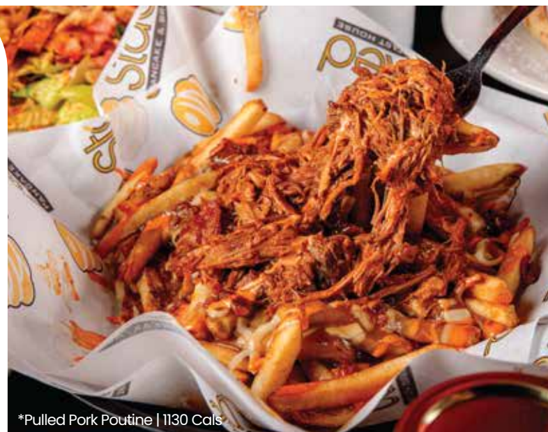
*Pulled Pork Poutine | 1130 Cals

Pulled Pork Poutine | 1130 Cals $15.99 Marinated pulled pork, bacon, mozza & gravy topped with buffalo ranch.